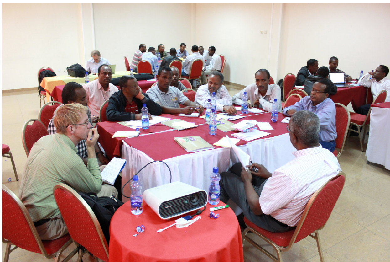
Research teams use working sessions to tighten objectives and finalize work plans during inception meetings in Adama, Ethiopia.