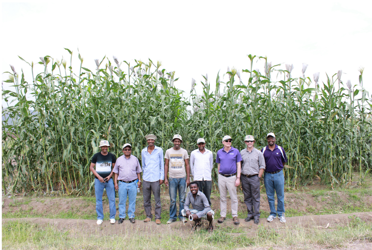
A team of sorghum researchers at a field visit at the Werer Research Station in central Ethiopia.