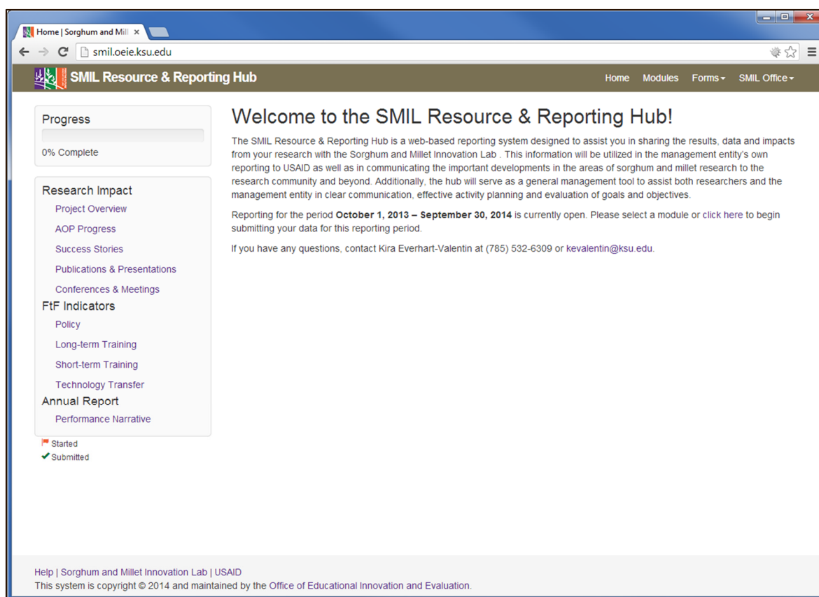
Figure 3. Screenshot of the SMIL resource and reporting hub interface