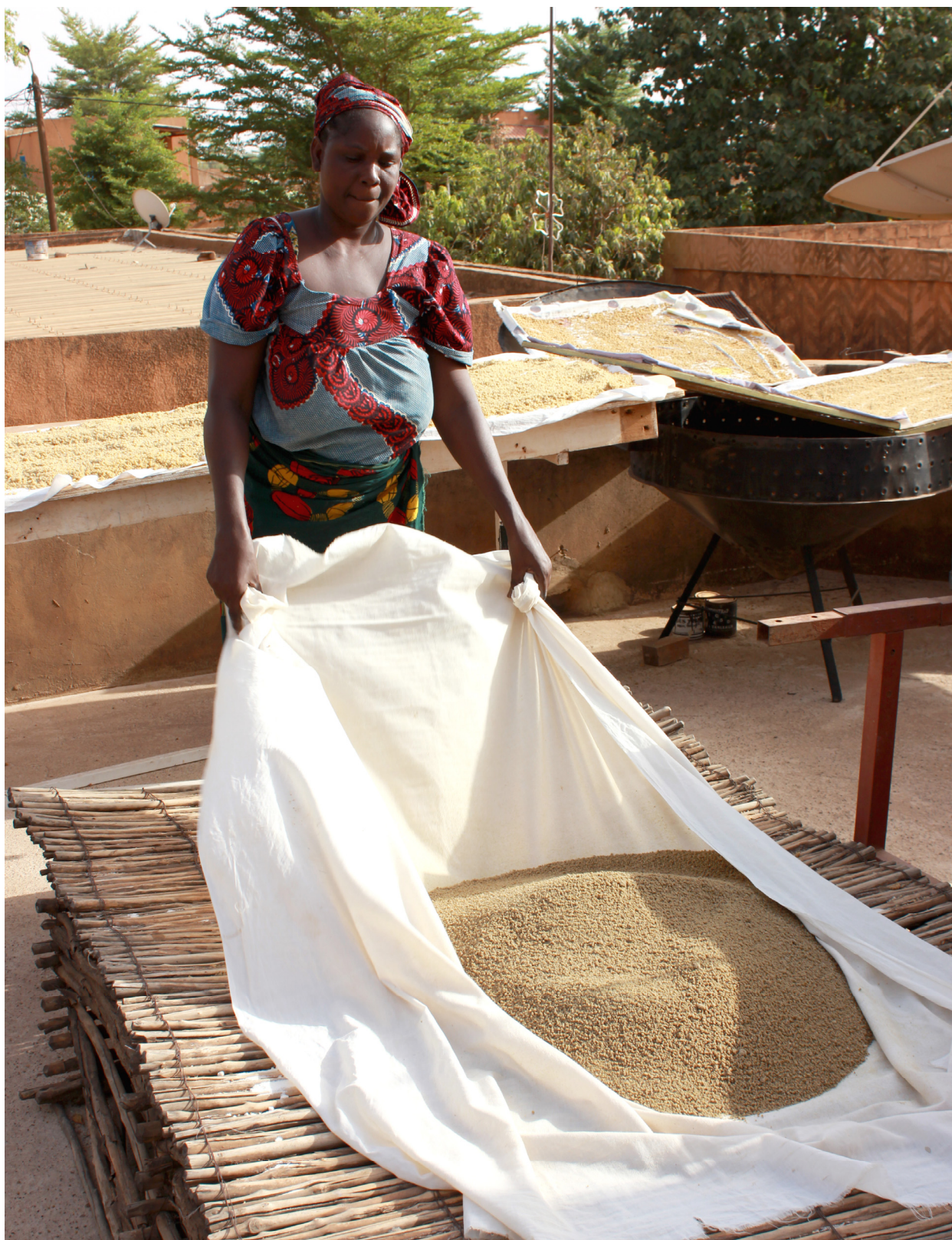
A processor in Niger dries her product on a rooftop in preparation for packaging and sale.