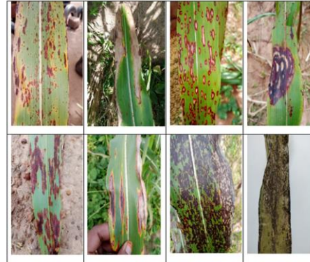
Foliar (up) and panicle (down) diseases found in Niger